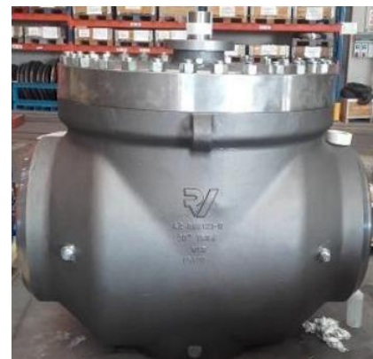
PYRSA's team and detail of some produced special casted parts