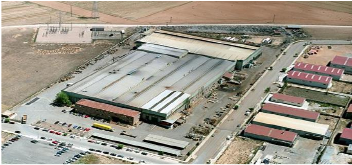
Facilities of PYRSA in Monreal del Campo (Teruel, Spain)